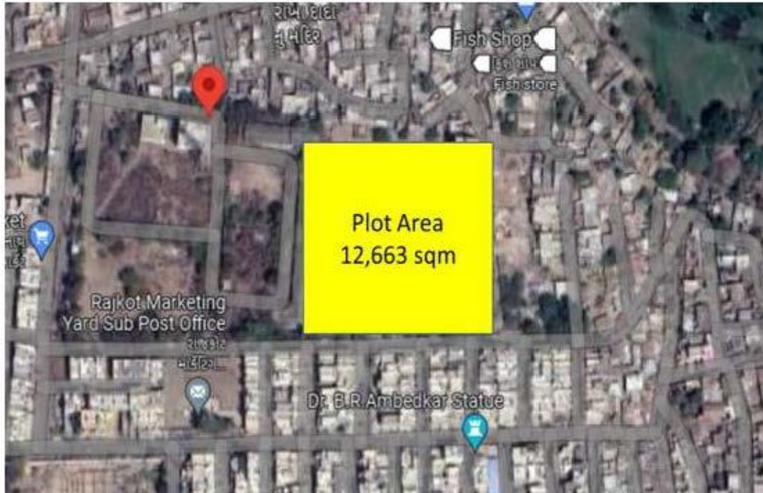
Location of Subject Site

The subject site is situated at 22°18'24.5"N 70°50'05.2"E near Narsingh Nagar Society. The site is adjacent to BSNL Telephone Exchange, Marketing Yard. The site can be accessed by a single road. It is surrounded by residential area. The subject site is at a distance of 1.5 Km from NH-27, 5.2 Km from ST Bus Stand, 4.8 km from Rajkot railway Station and 6.7 km from Rajkot Airport